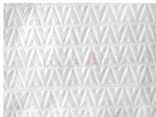
Cloth V Model