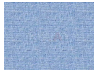
Cloth Common Model