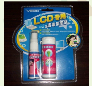
LCD clean kits